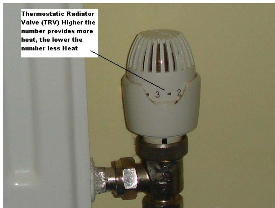
Figure 2 using a TRV

You can use the TRV to control the temperature in your room (see Figure 2 below).