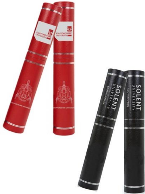
Scroll Holder Tubes