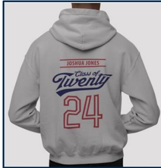
Example Back Print

Highlight Name – one name can be picked out the class list and highlighted in any colour, colour matched to logo. We also make the text slightly larger.