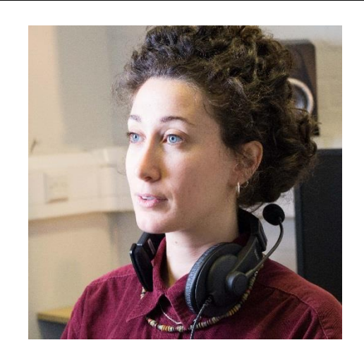
Headset 'at ease'