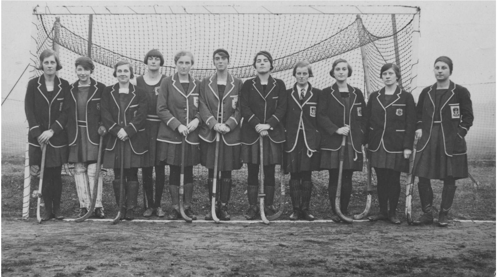
Bedford College Hockey XI 1922-1923