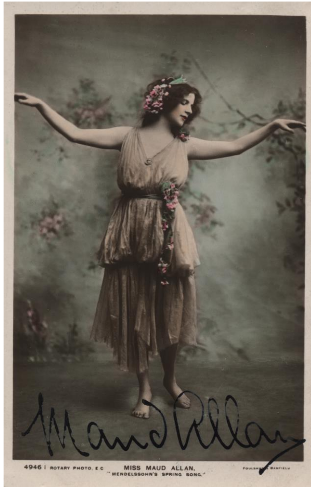
Maud Allen, 1910 (Ref: RW 14/1/1/6/8)