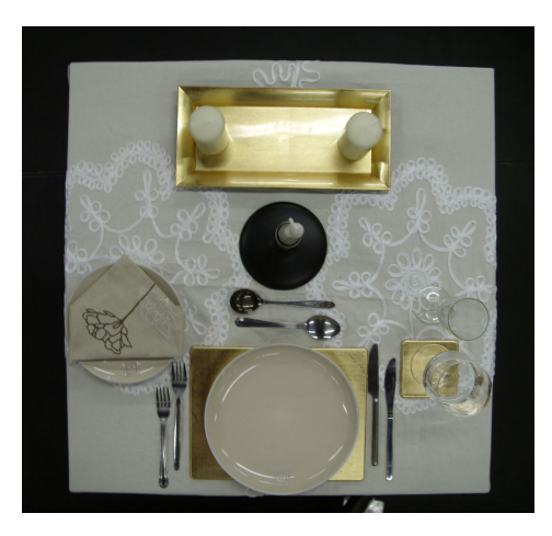
Fig.7. Dinner with Jenny , photograph of the table set for dinner which was transposed onto the table surface.

A photograph (taken from above) of my dinner table set beautifully for dinner is transposed onto the surface. I gesture to the image of the table objects such as the knife and fork, as if they are actually there. A large mirror is suspended above the dinner table positioned at an angle, so that it reflects the table image to the audience.