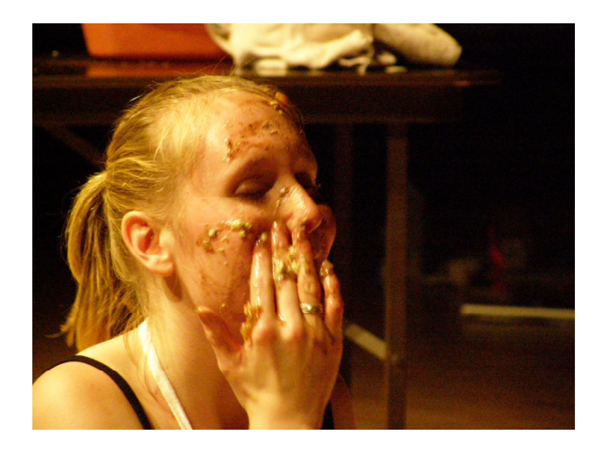
Fig.4. I Wish I had a Kitchen, Smothering my face with my kitchen 'fantasy.'

Required Lemons Flour Hearty Lamb Stew Traditional clotted Cream