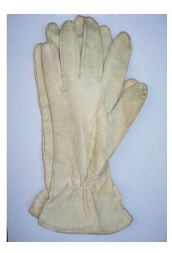
Fig 4. Objects from Lotos Collective practice workshop

manifestations of objects that emerged throughout the day demonstrated material things' capacity to document how we register our presence, and position ourselves as practitioners and scholars of theatre and performance. It is not just that the object acts as agent, but acts as part of an unstable temporal process of creation and destruction occurring alongside the subject. This dialogue highlighted the need to engage with the issue of objects as more than a footnote or a visual apparatus. To return to Schumann's manifesto of 'things': 'they too defy their subservience and the ungodly meaninglessness to which they are delegated by the habits of the republic; they too are infested by the sourdough of cultural insurrection' (51). The aim