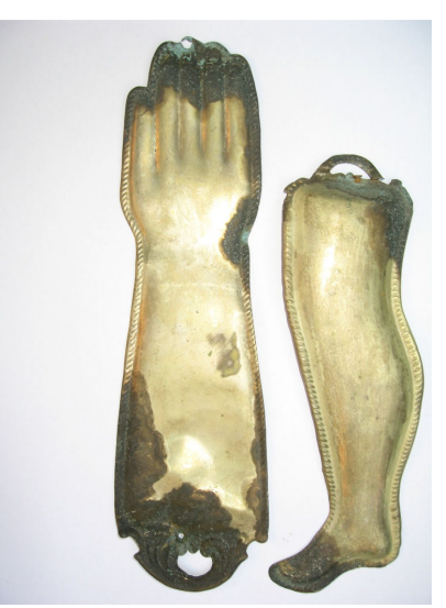
Fig 2. Objects from Lotos Collective practice workshop.

Objects of Engagement took the physical object in the widest sense as its starting point, placing it at the centre of academic dialogue. Rather than being perceived as passive products of consumption, silent, inert materials – often ignored or marginalised in subject-oriented critical discourse – were given voice and considered as embodiments of processes that reveal ontological aspects of the world, self and other. The positing of the object as entity, liberated from the tyranny of the subject, is