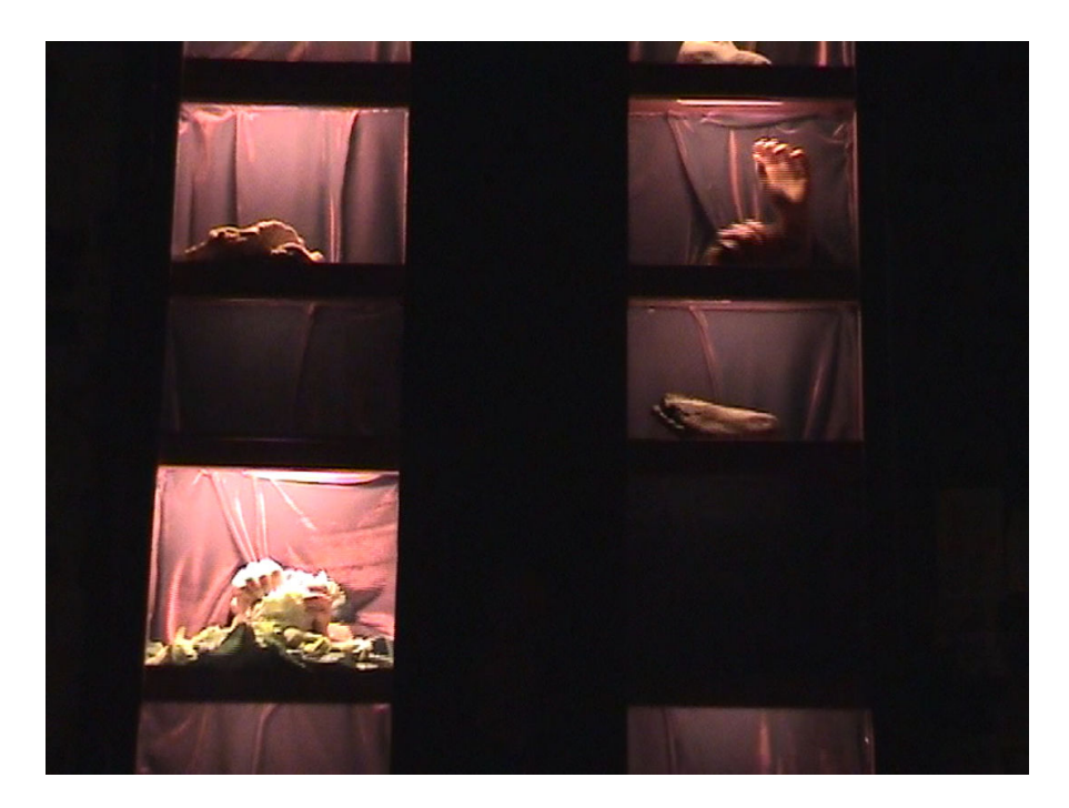
Fig. 4, cabbage, video still. Declan O' Meara.

When fruit and vegetables feature in the cabinet they are often ripped apart, cut or squashed. We chose to 'dissect' the fruit and vegetables rather than the organs, as that would have referenced their moribund existence as meat. Interestingly, spectators frequently found the performance of the fruit and vegetables more disturbing as compared with that of the organs. These dismemberings tie in with our impulse to link our own curiosity to what seems to be man's insatiable need to take things apart to find out how they work, the endless quest to get inside things and reduce them to their component parts in order to get to the bottom of their mysteries. An influence in this instance was Tim Marshall's Murdering to Dissect which thematises how easily this drive can degenerate into destructiveness and criminal activity.<sup>7</sup> Marshall's study on grave-robbing takes its title from Wordsworth's 1798 poem 'The Tables Turned':