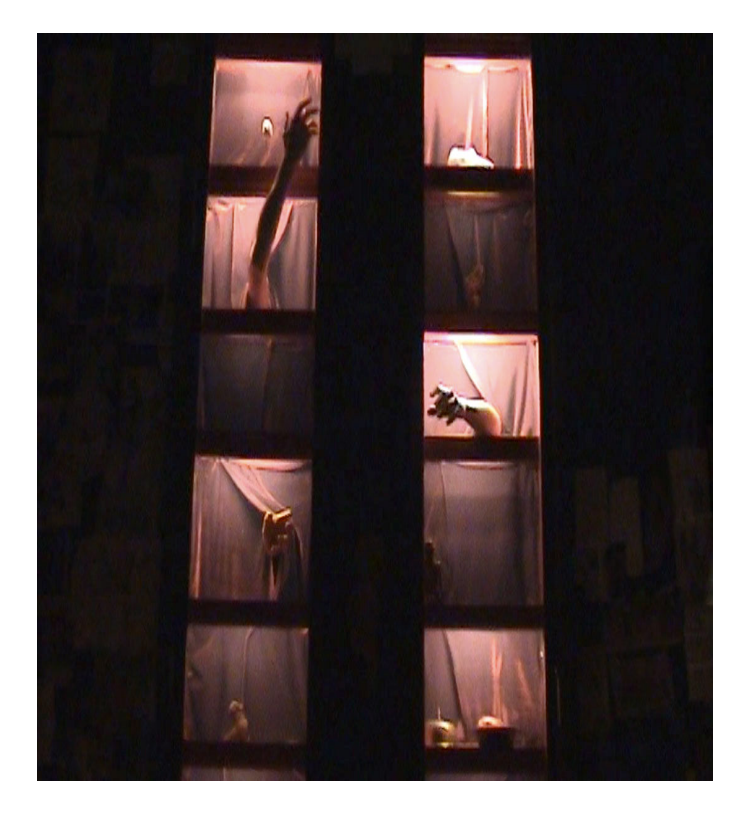
Fig. 5. arms in isolation, video still.

This extract from Wordsworth's poem has also featured as an 'object' in our cabinet.<sup>8</sup>