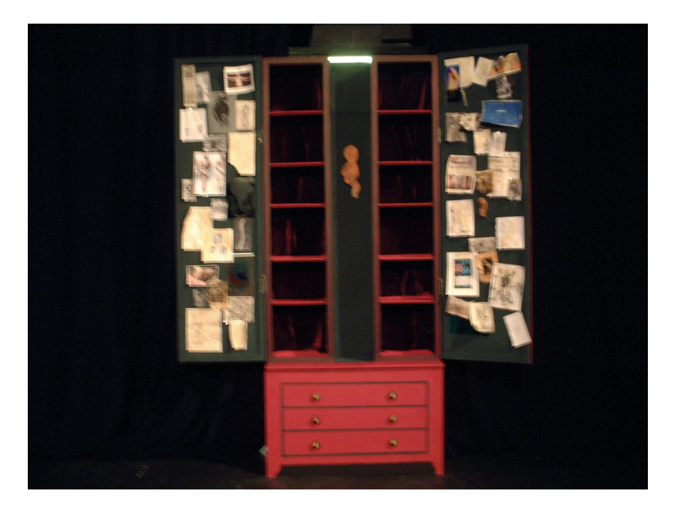
Fig. 1. The Cabinet, dvd still, 4 March 2007.

The Cabinet of Curiosities was the first piece of work to be devised and performed by GAITKRASH. We are a small performance company, based in Cork in the South of Ireland, consisting of a sound artist, Mick O'Shea, and two actors (Regina Crowley and myself). The piece is designed to tour, but our preferred site is a small, dark narrow space with an audience capacity of about twenty.<sup>2</sup> The set is a wooden cabinet, 10ft tall and 5ft wide, mounted on a platform. It consists of 12 individual compartments, 6 on either side. Each compartment is equipped with an individual dimmer switch, controlled by the performers, and a pair of red velour curtains, creating the effect of 12 individual mini-stages. The cabinet is backless, and the two performers are concealed behind it. The sound artist sits, with his table of instruments, to one side of the performance space, and has a clear view of what is happening in the cabinet. Once the