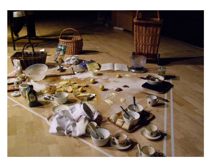
3pm-4pm: The Cottage Cream Country Kitchen<sup>8</sup>

Required Tahini paste Walnut oil Nuts & seeds Zinc supplement tablets.