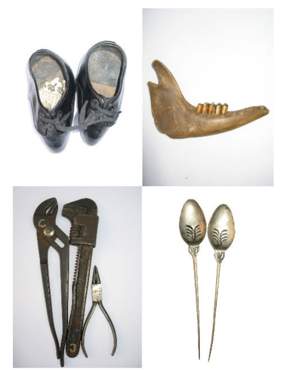
Fig 3. Objects from Lotos Collective practice workshop

In the 2006 best seller A Whole New Mind , Daniel Pink argues that we are entering a new era, which he calls 'the conceptual age.' As opposed to the industrial age and the information age, which valued physical strength and then sequential analytics, Pink proposes that 21<sup>st</sup> century western society is producing strategies of 'high concept and high touch.' In other words, things that combine seemingly unrelated ideas to create new inventions and designs, or which aim to empathize and interact on a more visceral