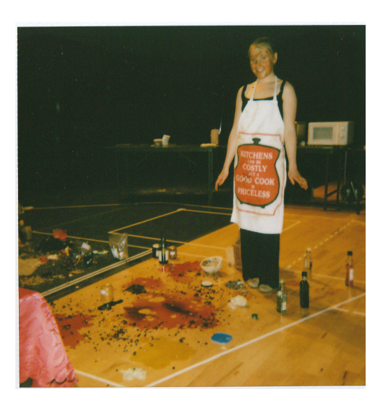
Fig.5. I Wish I had a Kitchen, Posing inside my 'Vintage Kitchen.' After five long hours my kitchens were created. You can picture me inside my kitchen fantasy wearing my best 'domestic goddess' smile.

I felt nauseous from the food smells. The balsamic vinegar made my eyes water, the lemon and salt stung my face, and the tahini paste and stilton cheese felt thick and uncomfortable on my skin.