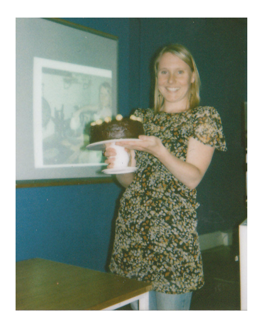
Fig.11. Giving Cake, Royal Holloway College, University of London, June 2008.