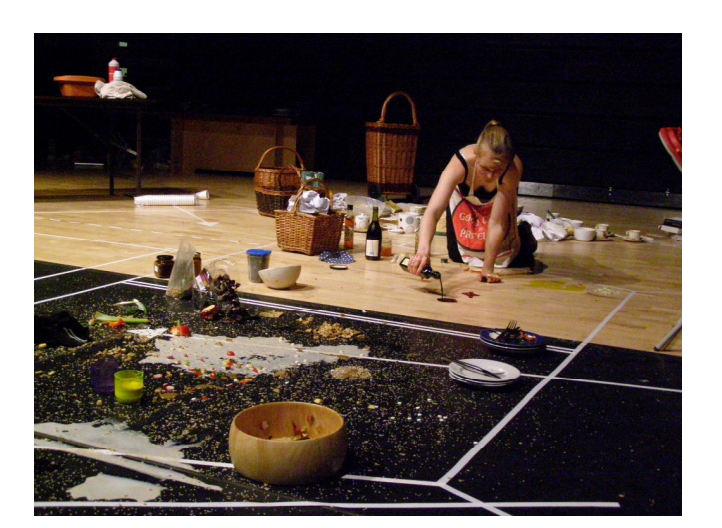
1pm-2pm: Elemental Walnut and Zinc<sup>7</sup>