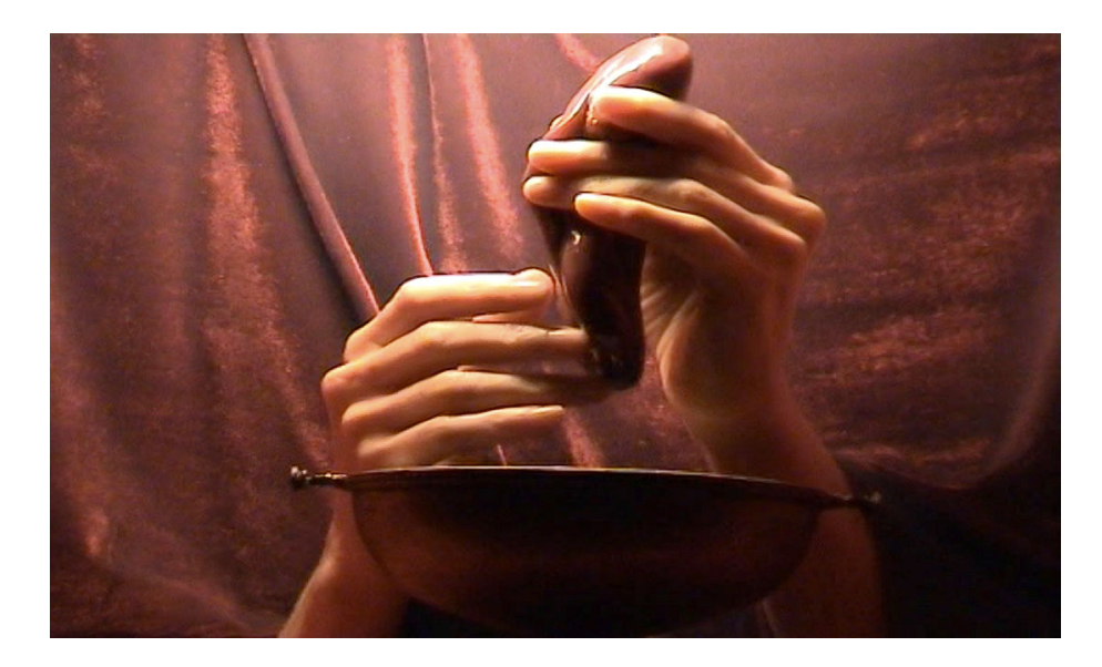
Fig. 3, pig's kidney performed in the cabinet, video still. Declan O' Meara.

The decision to use animal organs in the cabinet, such as the pig's kidney seen in the image above, was informed by our idea of rupturing the sense of boundary between inside and outside and the desire to contemplate the mysterious theatre of the inner forces of the body that usually remain invisible to the naked eye. This impulse was informed, for example, by the paintings of Francis Bacon, which visually represent the disruption of the idea of the skin as a barrier between inside and outside or of the body having discrete boundaries. As Giles Deleuze argues, 'what fascinates Bacon is not movement, but its effect on an immobile body: heads whipped by the wind or deformed by an aspiration, but also the interior forces that climb through the flesh' (xii). When we considered the ethics of 'using' the organs and body parts of defenceless - albeit dead - animals for our art, we assuaged our conscience with the knowledge that we were rescuing them from a moribund fate as meat for purchase and consumption, giving them a brief 'career' as dramatis personae in the theatre. To date, no audience member has objected to or expressed offence at our use of animal organs. Responses usually come in the form of visceral reactions, such as 'I felt like my liver was being stroked.'