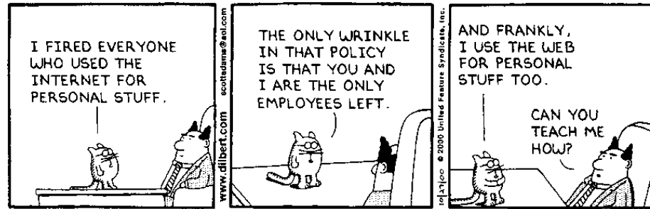
Fig. 1. This “Dilbert” comic strip suggests that personal Internet usage is widespread in the workplace.

Illustration has figure number, caption, and source.