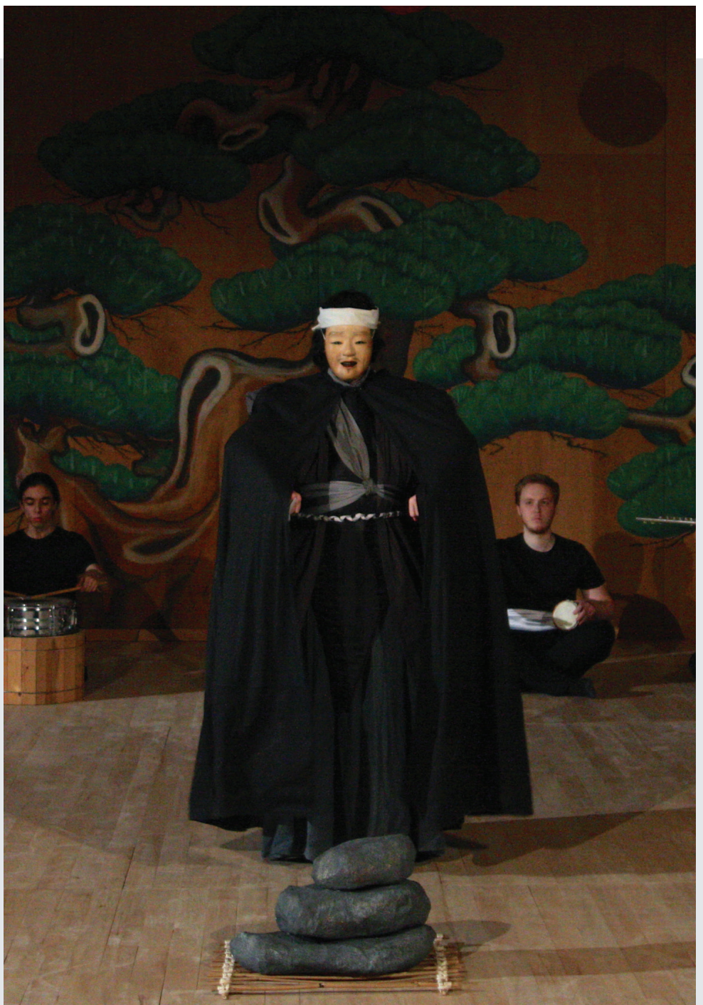
100 / 00/