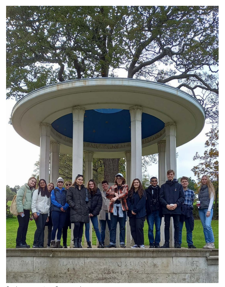
Students on a trip to Runnymede.