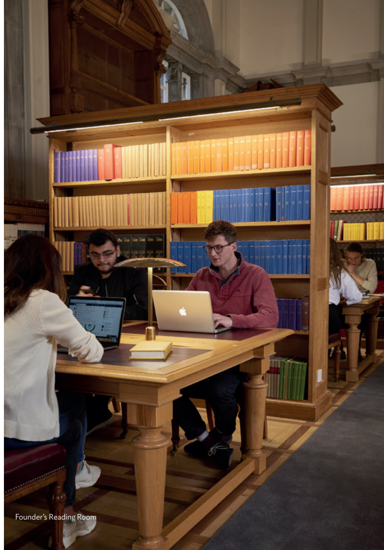
Founder's Reading Room