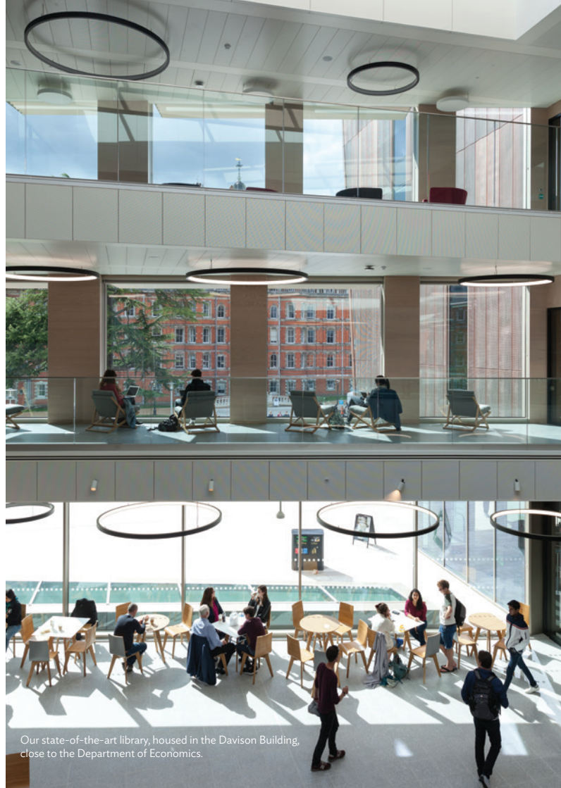
Our state-of-the-art library, housed in the Davison Building, close to the Department of Economics.

CUTTING-EDGE RESOURCES INCLUDING EXPRESS LAB AND BLOOMBERG FINANCIAL DATABASE