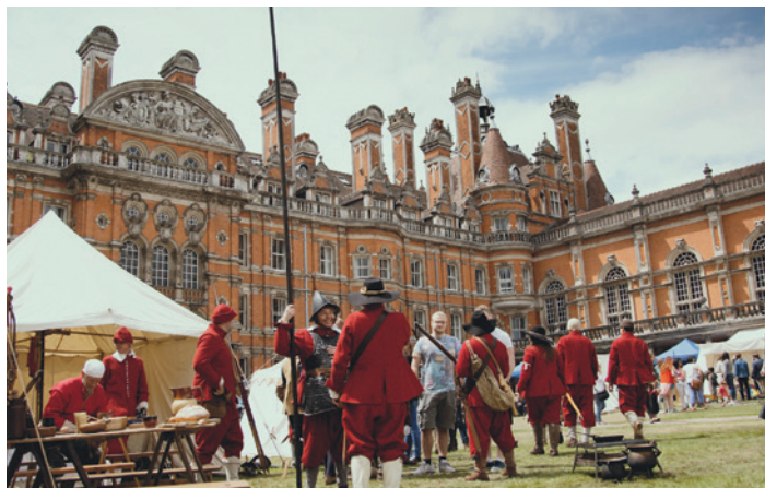
Living history at the Royal Holloway Festival of History

Recent employers for our graduates include the Department of Education, BNP Paribas, the Home Office, Accenture, Teach First, Penguin Books, The Guardian, National Geographic, Birmingham Museum and Art Gallery, Channel 4 and Classic FM.