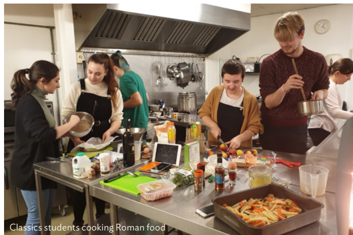
Classics students cooking Roman food

Royal Holloway is part of the University of London, which is home to a world-class community of teaching and researching classical academics. As a student at Royal Holloway, you will have the option (subject to availability) to choose from a huge range of modules offered by other London colleges such as UCL and King's College. This gives you unparalleled choice in your degree course and access to exceptional resources. Senate House, in central London, houses not only the Institute of Classical Studies library, but the University of London library, to which you will have access along with other college libraries in London.