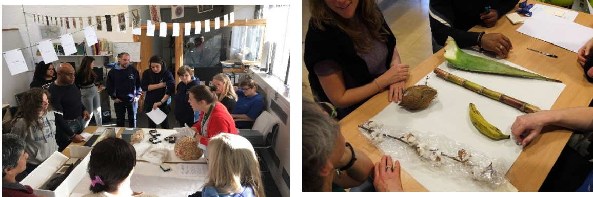
Wilberforce School staff INSET day at Kew, February 2019.

The School Museums initiative took a ‘whole-school’ approach in which in principle every pupil and teacher in the school was involved. This also extended to the wider community so parents and caregivers could contribute by lending culturally significant objects for curation and display. The process of developing educational resources was participatory, with teachers involved in choosing materials that best supported their teaching. The resources created were designed to support the National Curriculum, including Twenty-First Century Learning, Spiritual, Moral, Social and Cultural (SMSC) development and Personal, Social, Health and Economic (PSHE) education.