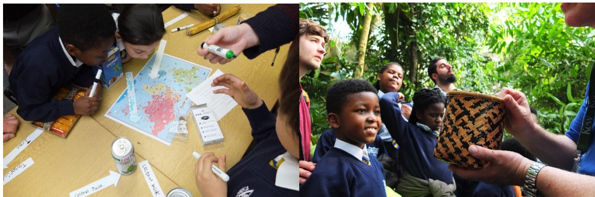
St. Monica's School 'museum crew' visit Kew, March 2019.

From the beginning, St. Monica's teachers elected to follow a distinctly cultural approach. The vision was for a display featuring seven plant-based artefacts – one submitted from each year group – which had the potential to represent the various cultural backgrounds of the school's pupils. To this end, pupils were asked to elicit loans from their families and broader communities and invited to explain to fellow pupils the relevance of their objects to the final exhibition. In order to arrive at the final list of objects, pupils then voted by year group. With object selection resolved early on, the emphasis turned to developing museological skills. A 'museum crew' composed of two pupils from each year was elected to undertake visits to a range of museums – including Benjamin Franklin House, the Natural History Museum and Kew Gardens – and to share the knowledge they gained on these visits with their fellow pupils. At Kew, the workshop took the form of three activities: looking at objects (in the collections store), sorting objects, and handling objects.