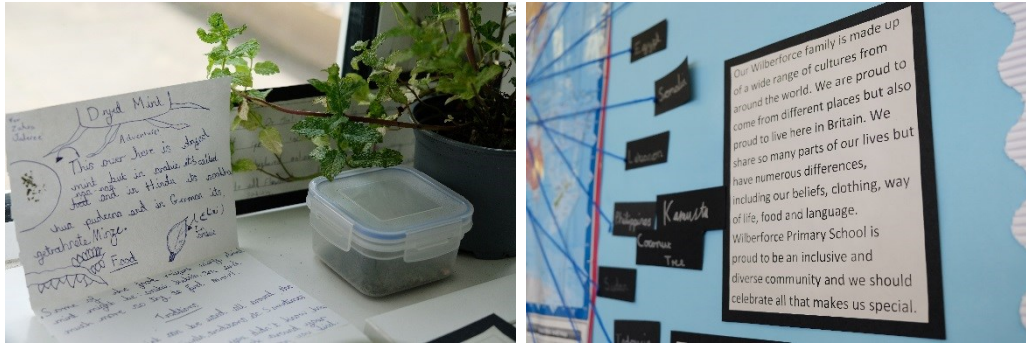
Plant and human diversity: Wilberforce School Museum of Plants and Cultures, July 2019.

In both cases the launch events were well-attended by parents who evidently took great pride in the objects on display and in the cultural communities which they represented.