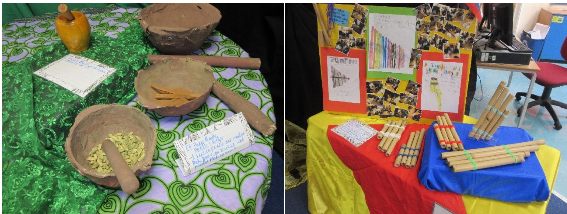
Learning through making at St. Monica's school museum, July 2019.

The schools launched their museums to pupils, parents and carers, and guests in July 2019. The St. Monica's museum – Our plants, our people – represented the cultural approach to plants and plant-based objects which the school had adopted from the outset. The seven original objects provided the basis for pupils' creative work in art, design and technology. The principal themes under which the objects were displayed were: 'Ceremony and celebration'; 'Fashion forward'; 'Fabulous food'. A further theme, "Plants and trees' was added as the result of a meeting between the learning officer and the lead teacher in July 2019.