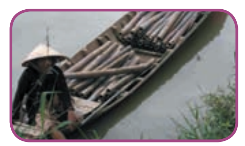
Figure 2a. Fisherwoman with traps for eels in flooded land

Since the late 1960s Vietnam has undergone an agricultural revolution. In the 1960s rice breeders at the International Rice Research Institute (IRRI) in the Philippines began to produce the 'IR' strains of rice, such as IR5 and IR8. Research scientists in Vietnam adapted these for local conditions and they were available in Vietnam from the year 1966<sup>i</sup>. These plants are short stemmed, take ninety to one hundred days from sowing to harvesting and are high yielding (5 tonnes per hectare is normal, 8 tonnes is not unusual). The big difference is that these rice plants are grown by irrigation during the dry season. To do this dykes have been raised around the fields. Originally this was done to keep irrigation water inside the fields, but it served a second purpose as well: at the start of the flood season in July and August the dykes delayed the entry of flood water into the fields, thus extending the end of the growing season. In 2004 a group of farmers in Cho Moi, a district of An Giang