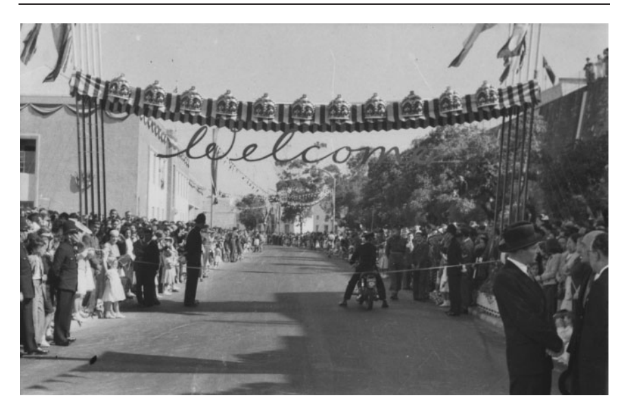
Figure 3 Crowds await the Queen's passage on the Queensway road.

reciprocated and rewarded. This is a theme to which we will return below.