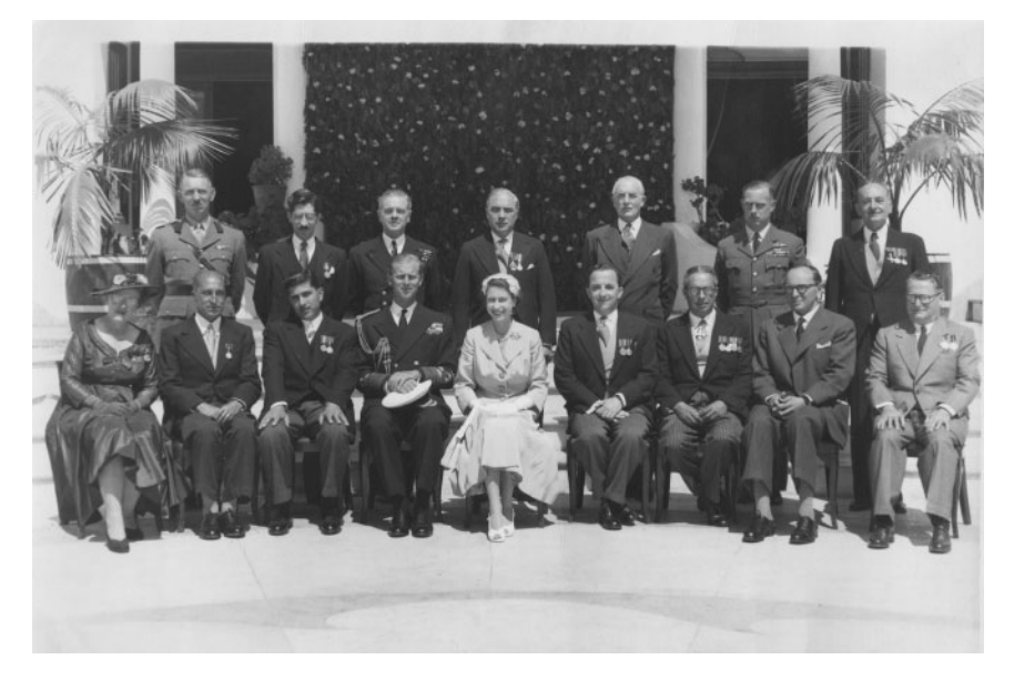
Figure 4 Official photograph taken prior to the Royal lunch. Gibraltar's Chief Minister, Joshua Hassan, can be seen to the right of the Queen.

community in terms of acknowledging that Gibraltar was not simply a British fortress. The official photograph prior to the Royal lunch shows the Queen and Prince Philip sharing the front row with elected local representatives of the City Council (Figure 4).