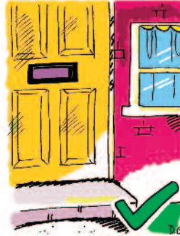
Make sure your home looks occupied while you are away