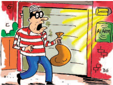
Burglar alarms and lights will deter thieves

your front and back doors and keep them locked at all times – even when you are at home.