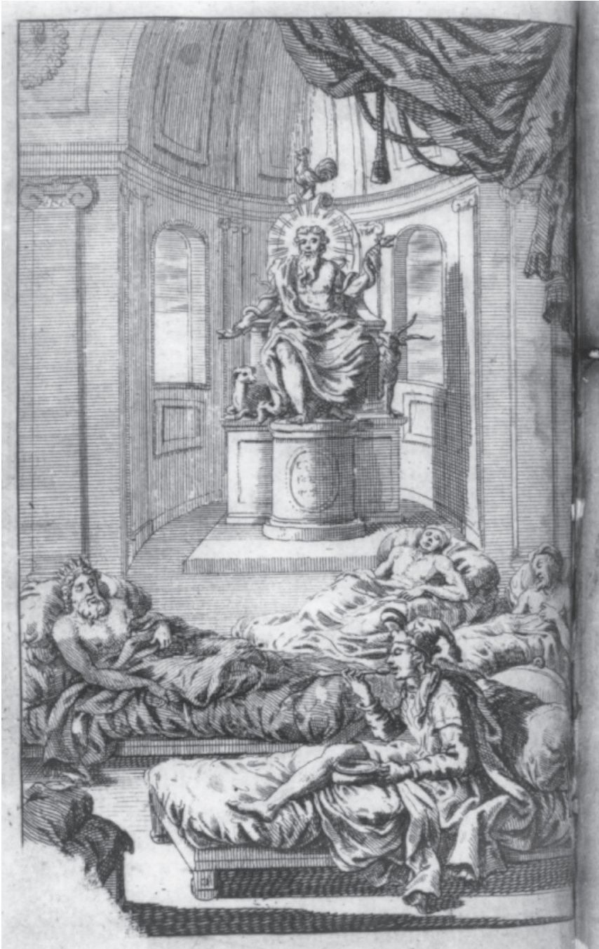
FIG. 4.1. Frontispiece to Lewis Theobald, Plutus: or, The World's Idol (1715)