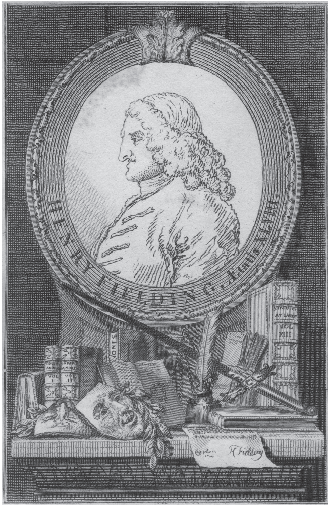
FIG. 4.2. Henry Fielding: line engraving by James Basire after Hogarth