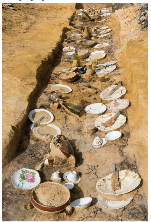
Fig. 3. 'The excavations of part of the banquet in 2016.' Daniel Spoerri, Le déjeuner sous l'herbe , 1983/2016. 12 February 2018.

later, a symbolic resurrection of the meal would take place. The banquet's decaying (s)cenography would acquire the characteristics of an archaeological find, a relic of a performance that lasted a lot longer than usual. Indeed, this performance might be thought of as having continued under the ground for decades after the meal was over. Spoerri thus played with the notion of time, which can be both devouring and disgorging.