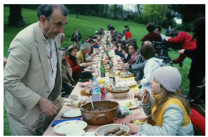
Fig. 1. 'Daniel Spoerri (standing on the left) during Le déjeuner sous l'herbe, 1983'. 12 February 2018.

Drawing on performance theory, I will stress how commensality and the sociability of the table offer the possibility of active audience participation. These elements, together with the banqueters' performative involvement, have constituted the basic components of the banquet in history. It should, therefore, be productive to explore how these components are being rediscovered and reproduced in contemporary banquet performances.