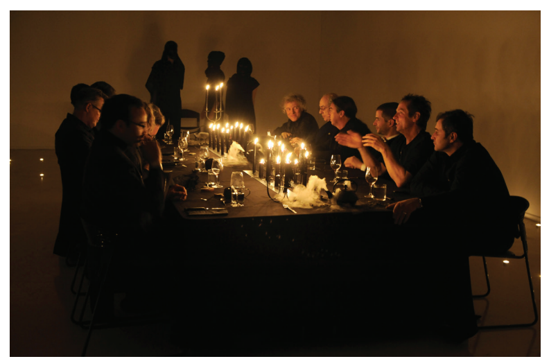
Fig. 5. Emmanuel Giraud, Devenir gris , 2009.

black egg, raddles of rare rabbit in cocoa juice, and Guinea fowl in tombstone, among other morbid delicacies. This dark, highly aestheticised scenography of vision and taste is dramatically eloquent: the banquet's menu and recipes, just like the props<sup>12</sup>, tell a story of mystery and death and approach this topic with black humour.