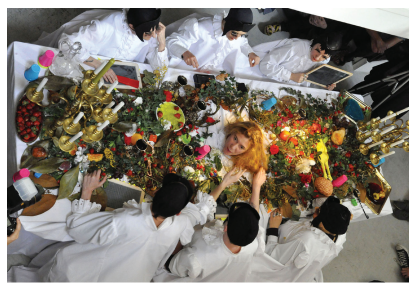
Fig. 6. La Banquette des Platonnes, 2016.

and her philosophical discourse is 'ingested' by the other female symposiasts. Precarious food (rotten fruit, candies, and marshmallows) and wine are offered only to female spectators. Male spectators cannot enjoy this oral experience, since their mouths are stuffed with sanitary towels. As Nariné Karslyan, who is part of Les Platonnes, told me, the aim was to achieve a state where the men can, for once, remain silent and listen to the philosophical discourses pronounced. The participants in this banquet performance thus communicate a clear political message against the diachronic male supremacy, during which women's mouths were shut for centuries. Women were not allowed to express their own version of important philosophical issues. Similarly, they could not easily indulge themselves with the sensual pleasures (love, wine, and food) that had been normally reserved for men. The served for men.