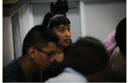
Fig. 5 and 6: Surrogate Speakers, Singapore, image courtesy of Sam Chow.

conveying and transmitting an authored, 'source' narrative: