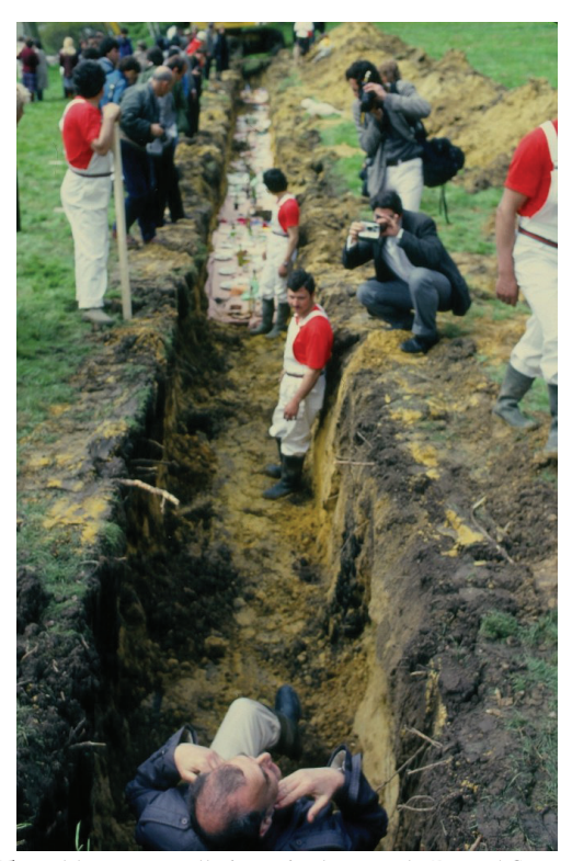
Fig. 2. 'The tables are installed inside the trench. Daniel Spoerri, in the foreground, is directing the operations'. Daniel Spoerri, Le déjeuner sous l'herbe , 1983. 12 February 2018.

actions'. One of them that I will briefly present is Déjeuner sous l'herbe ( Luncheon under the grass ), whose title is a reverse reading to Manet's famous painting Déjeuner sur l'herbe (1863). In the outdoor area of a château, Spoerri set a long table for a hundred guests, while a forty meter-long trench was being dug. In the middle of this feast, Spoerri ordered the diners to bury the tables with the food leftovers inside the trench. In 2010 and 2016, in a type of archaeological excavation, the banquet's leftovers were revealed once again, in a gesture to remind