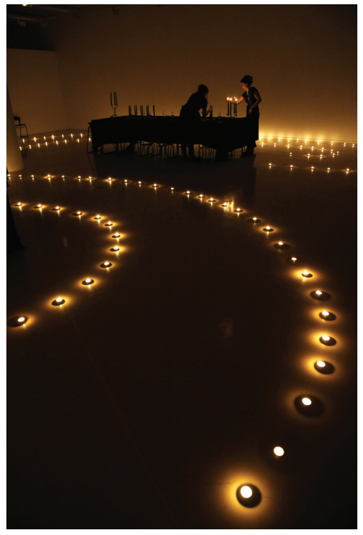
Fig. 4. Emmanuel Giraud, Devenir gris , 2009. Photographers: \ \ \, Luc Jennepin / Emmanuel Giraud. Courtesy of the artist.

of a well-chosen group of table guests' (11, my own translation from the French).