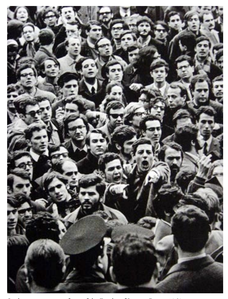
Students protesting in front of the Faculty of Letters, Rome, 1968.