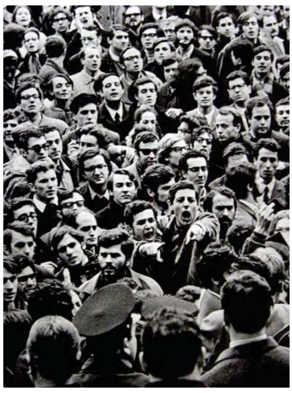
Students protesting in front of the Faculty of Letters, Rome, 1968.