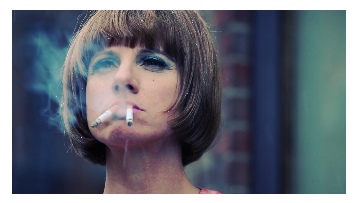
Fig 6: Launderette (2013), by Karen da Silva. Guildford International Music Festival.