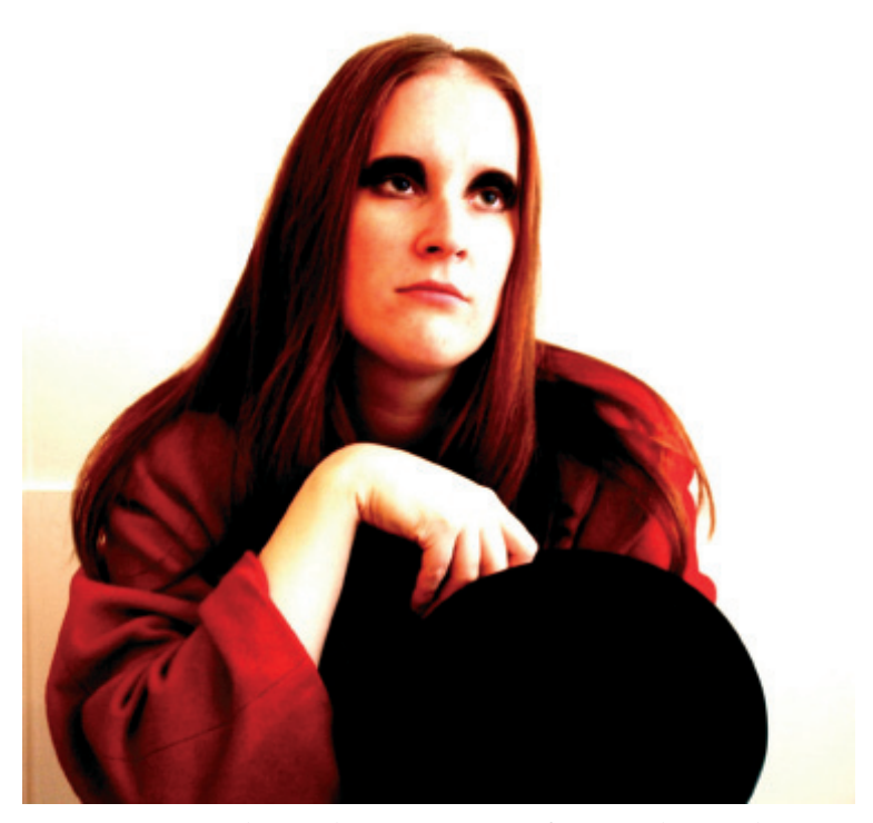
Fig.4 Waiting to be served (2011).