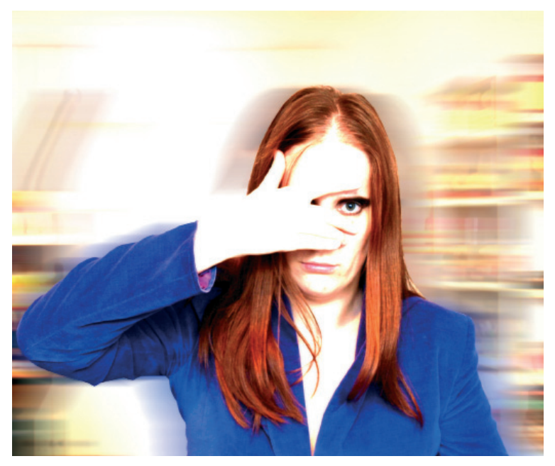
Fig.5 'An identity of contrasts' (2011).

The result of this kind of deviant behaviour can be ambiguous, even wry. As adopted by contemporary artists, the previously comical role of clown has evolved into a more reflective performance with a more cynical figure (Fisher 30). Donald McManus even suggests that the 20th century was the century in which the character of the clown ceased to be comic. The clown has become the means through which the more tragic, modern impulse of the world can be expressed as an insight, a question, or a commentary that is rather more confrontational than it is entertaining, causing the audience to laugh in spite of themselves .*