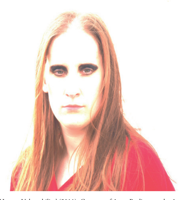
Fig.11 'Human Vulnerability' (2011).

Through the clown's display of human vulnerabilities the audience will recognize themselves as well as the emotions and imperfections of human nature. This is the crucial point about the performance of clown: the audience 'discovers' that they all are, in some sense, clowns as well (Delpech-Ramey 140).