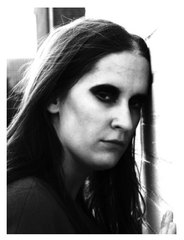
Fig.12 'Performing the self' (2011).

As such the clown constantly deals with what it means to be human; while commenting on the absurdities of life he encourages contemplation with particular emphasis on an existentialist viewpoint (Peacock 26, 14 and 106; cf. Bailes xvi). But because the performance of the clown remains double-edged as both the comic and the tragic occur in the same experience simultaneously, any empathic identification with the figure can quickly pass into an uncomfortable reminder of personal failure when identifying too closely with the clown as victim of a seemingly comic situation (Kris 214). The status of the clown therefore represents a paradox in that the type is both depreciated and valued, rejected as well as embraced (Klapp 161). Indeed, the clown precisely has to be valued and taken seriously, as a situation can only be experienced as 'tragicomic' when the object of sympathy retains a minimum of dignity (Hofstadter 302; Delpech-Ramey 136).