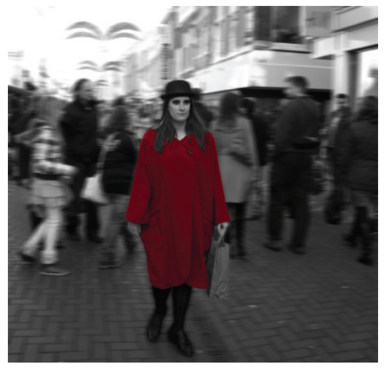
Fig.3 'Out and About in Public Space' (2011).

Gradually the different forms of physicality, motion, physical accents and postures of Annot started to emerge. Putting together the appropriate costume for my clown did not primarily include conscious decisions either, but happened rather more arbitrarily, adapting garments that I could find in various wardrobes. Annot's short, white dress and black stockings underline her childishness as well as her gender, while the blue vintage jacket on top more generally emphasizes the figure's angular shoulders. The other main component of Annot's costume is an oversized, red duffle coat, which seems particularly appropriate since the colour red appears to be iconic to clown. Upon her head Annot often wears a bowler hat - another iconic clown attribute - while the glasses that I, as an individual, would otherwise wear are shadowed in the black circles around her eyes. I chose plump shoes to fit in with the rest of Annot's costume so as to accentuate my somewhat clumsy gait as well as my feet: feet that in total relaxation point almost perfectly (heels together) to the right and to the left.