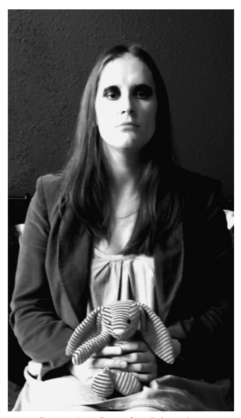
Fig.1 Annot (2011).