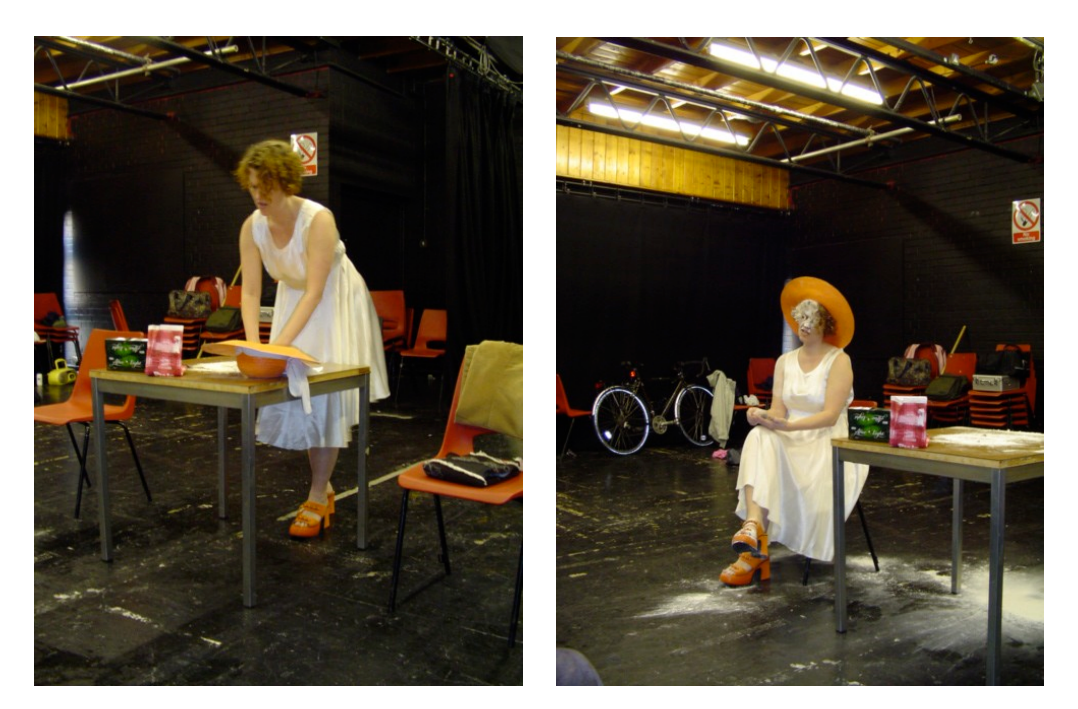
Fig 1 and 2.

They sit around at night now, drinking Schnaps and gin... Very carefully, in an attempt to avoid hurting my mint-man, I break off little pieces, place them in my mouth, while I continue singing the song about the angel flying backwards into the future. The smile never leaves my face. I swallow. Bit by bit I tear him apart. I place him gently in between my lips. I chew him with delight and pleasure, with a smile and a song. I swallow. The flour on my face itches. Every time I open my mouth tiny clouds form before me. I take pleasure in eating. I take pleasure in singing. I take pleasure in being watched and listened to. My eyes hold the eyes of those in front of me. I invite them in, ask them to take part in my pleasure, ask them to make me, make my action part of their desire. Do you want a piece of my man? Well, you can't have him, he's all mine. I created him, I'll eat him! ... this storm is called progress ... My after-eight-mint-flourman is gone, disappeared into my mouth behind my lips. My smile broadens. It's a pleasurable experience all together. A little pause before my lips part, let out the words in as caring a manner as I've eaten my man. My mum always said: 'Kerstin, if you want a man, you've got to bake one yourself.'