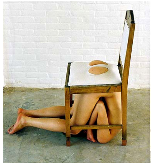
No Body at Home: Chair . Gerrit Rietveld Academie, Amsterdam (1996).

absence that is contained within the present body and share a consistent sense of loss. In works such as Pillar (1995), No Body at Home (1996), Body Parts (2001) and Cupboard (2001), Davids tries to enact the diffused contemporary subject by literally presenting the body as fragmented, abject and vulnerable with no coherent subject to be assumed. The scattered bodies reflect the spectator's own incoherence, a self caught in a moment of being and becoming, as 'a point of transition in a life eternally renewed, the inexhaustible vessel of death and conception' (Bakhtin 318). The performative installations confront spectators with a destabilizing experience by questioning the familiar demarcation of body and object and by negotiating a presence and absence dialectic.