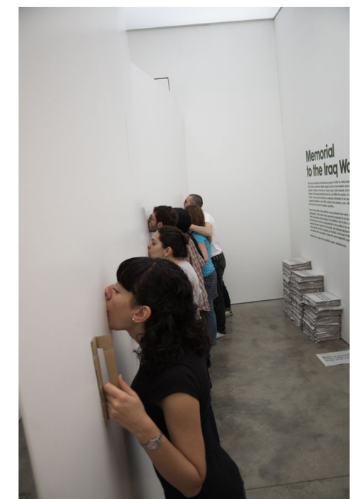
A Line, A Sentence, A Word. ICA, London (2007)

A Line, A Sentence, A Word was initially inspired by journalistic photographs of demonstrations and by Davids' memories as an individual growing up within the Palestine-Israel divide. The piece consisted of flat panels kept suspended in space by the mouths and hands of still and