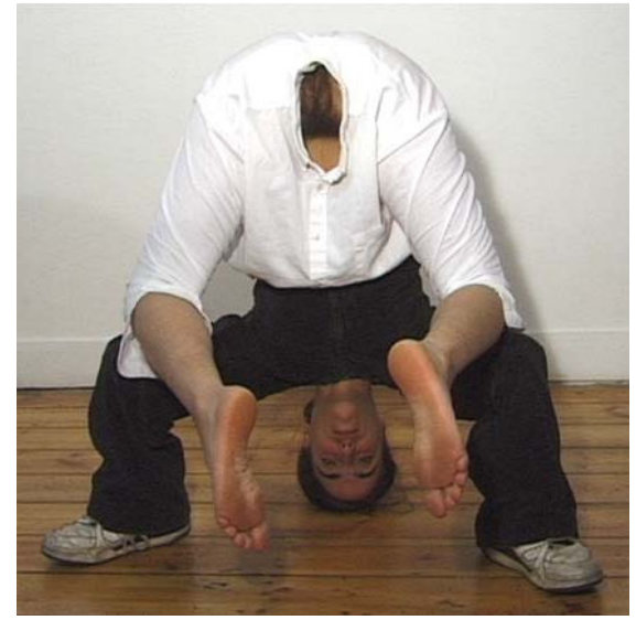
No Body at Home: Stool. Video still (1996).

The unsettling image of David's own body in No Body at Home: Stool for example immediately lends itself to the logic of opposites, which is one of the typical features of the grotesque life of the body for Bakhtin, 'the essential topographical element of the bodily hierarchy turned upside down; the lower stratum replaces the upper stratum' (Bakhtin 309). By constructing a different relation between the looking