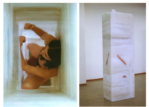
Pillar. Gerrit Rietveld Academie, Amsterdam (1995)