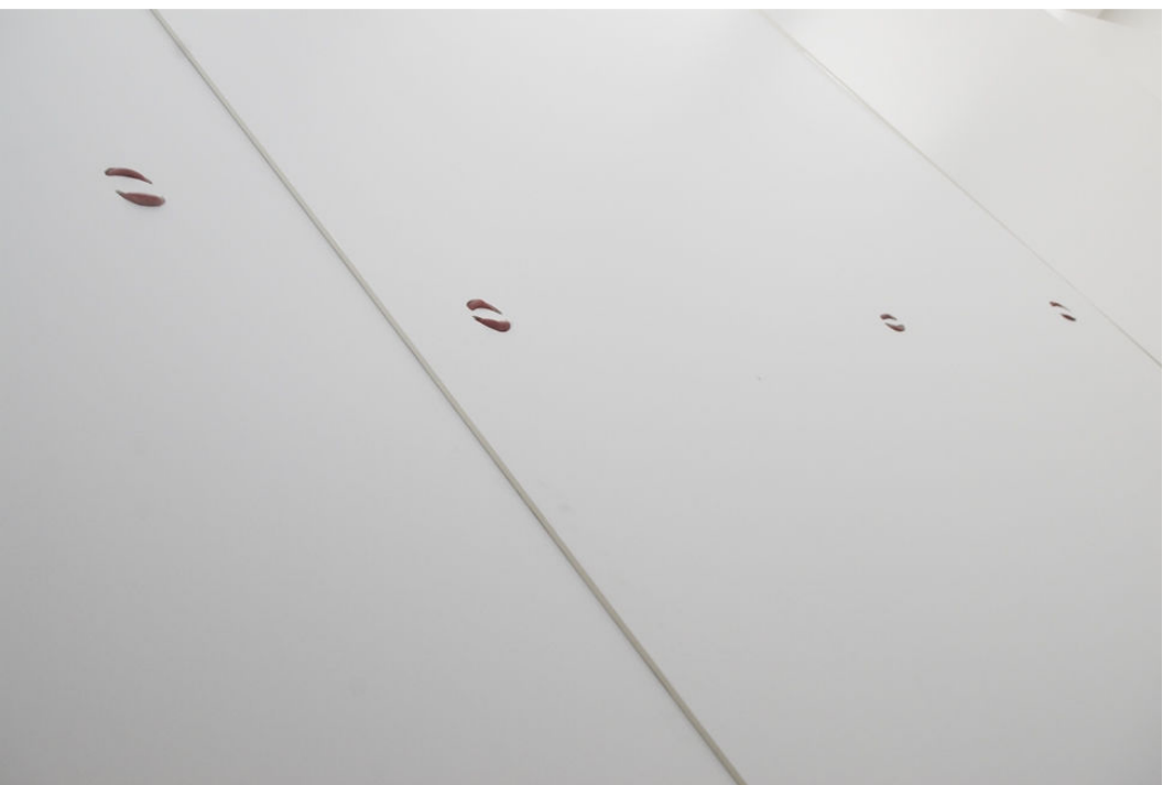
A Line, A Sentence, A Word. ICA, London (2007).