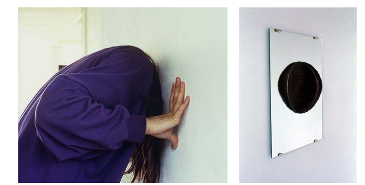
No Body at Home: Mirror. Gerrit Rietveld Academie, Amsterdam (1996).

nothingness; negativity that goes as deep into itself as possible, and is itself affirmation (Kristeva 110). Thus the contradictions become transcended; Being and Nothing are both contradictory and at the same time inseparable, this thesis prevents the closing up of the subject within